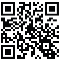
QR Code to our Facebook Page

Scan the QR Codes below to be taken directly to the pages listed above!