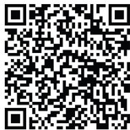
QR Code to our Online Registration Page